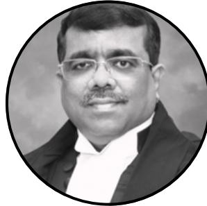
Hon'ble Mr. Justice Sandesh Dadasaheb Patil Judge, Hon'ble Bombay High Court Chief Guest